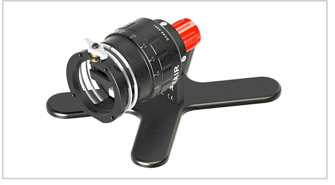
Optionally, we can supply a package with a DC65 head