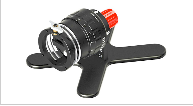
Optionally, we can supply a package with a DC65 head