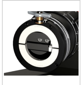
Jaws open wide for easy positioning of tube.