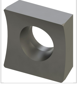
HSS TIALN HIGH QIALITY Reversible blade (two cutting edges)