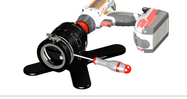
Tool adjusted to the diameter of tube to be machined in just a few seconds.