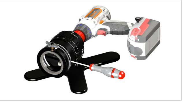
Tool adjusted to the diameter of tube to be machined in just a few seconds.