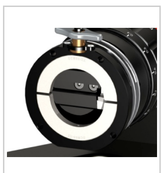
Jaws open wide for easy positioning of tube.

DC65: squaring and bevelling (optional bevelling tool holder) on the bench or directly on the tubes (dismountable foot).