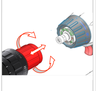
QuiXS: Lets you change the head or fit a chuck in just a few seconds.