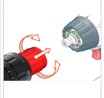
QuiXS: Lets you change the head or fit a chuck in just a few seconds.