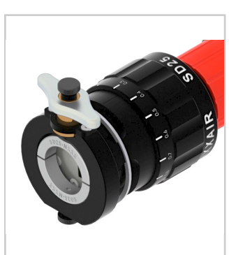
Jaw opens wide for easy positioning of tube.