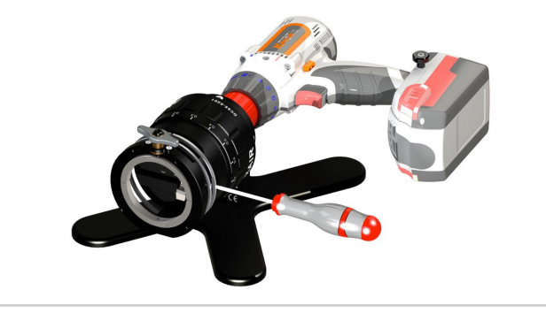
Tool adjusted to the diameter of tube to be machined in just a few seconds.